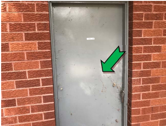
Photo 3. Exterior, throughout, door frames – suspected lead-containing white upper paint system.