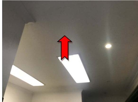
Photo 2. Interior, ground level, kiosk, ceiling – non asbestos-containing fibre cement sheeting.