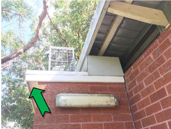
Photo 1. Exterior, throughout, eaves – non asbestos-containing fibre cement sheeting.